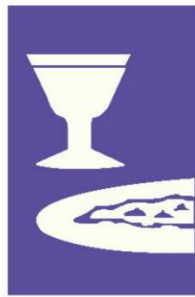
Maundy Thursday 6:30 p.m.