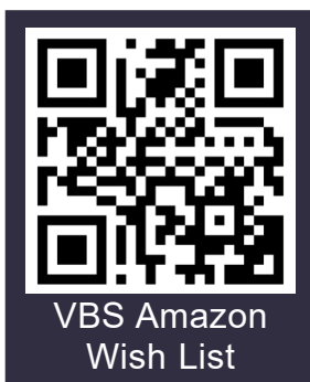
VBS Amazon Wish List