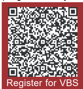
Register for VBS

age 4 to entering 5 th Grade and "Beyond Rainforest Falls VBX" for those entering 6 th -8 th Grade. Starting on July 1 st you can register your child on the church app, at BvilleCWC.com , or by scanning this QR code.