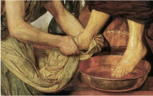
"Jesus Washing Peter's Feet" by Ford Maddox Brown