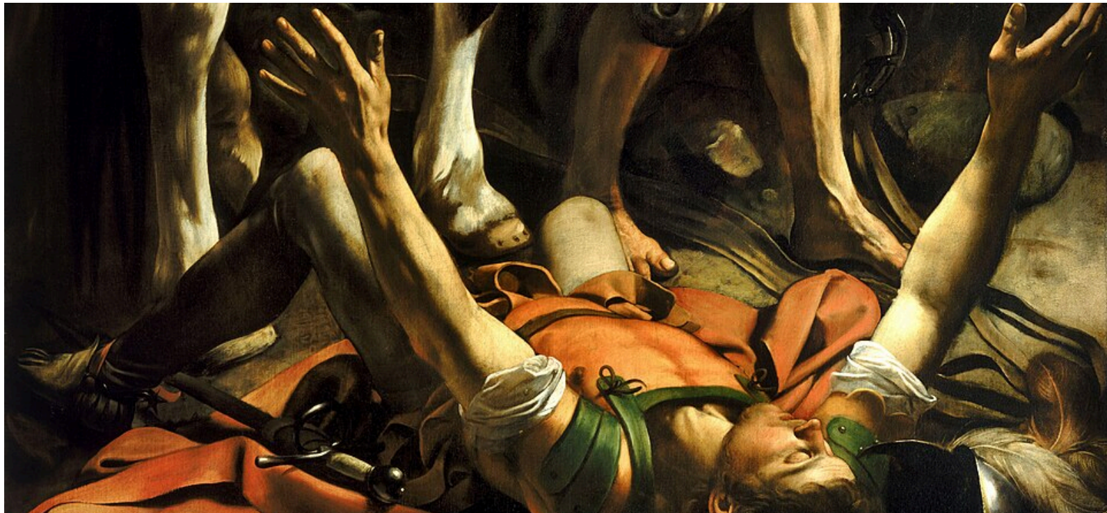
The Conversion on the Way to Damascus | Cravaggio | 1601 | Oil on Canvas | Location: Santa Maria del Popolo, Rome, Italy

Navasota, Texas | Archdiocese of Galveston-Houston