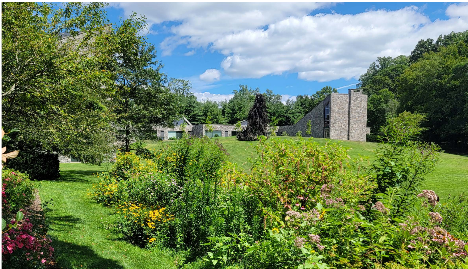
UUCSR Wildflower Garden

Next Quest: Wednesday, September 6, 2023 | Deadline for Content: Thursday, August 31, 2023