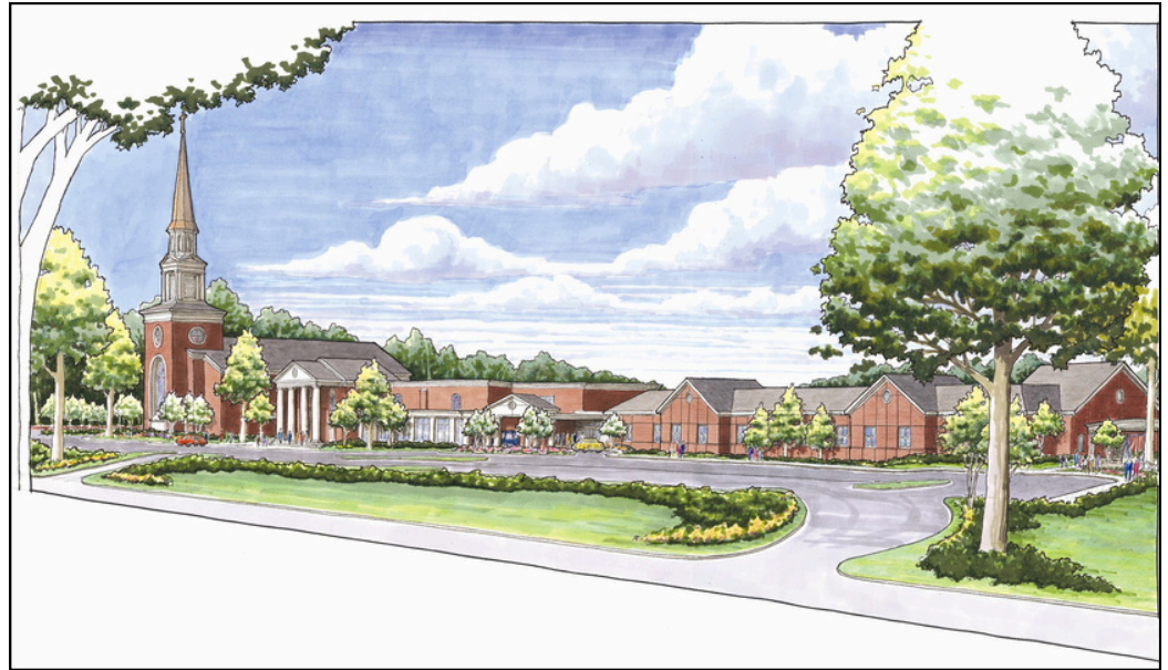
View from East University