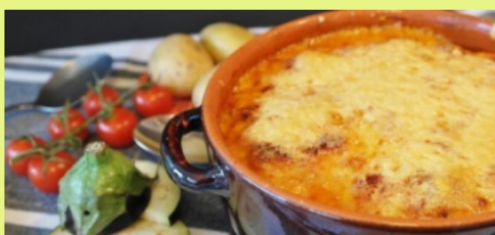
Congregational Care Casseroles?

We are exploring a new ministry opportunity for congregational care and need your help! If you would be willing be on a team (or even lead one) to create casserole based meals for members and friends of our Forest Hills Church family during times of illness, injury, hospitalization, birth, or the death of a loved one, I want to hear from you. The idea is to cook and assemble meals in our church kitchen that will be kept in our church freezer until needed.