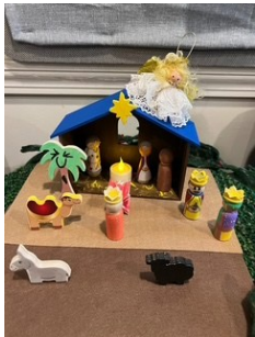
Children's Church Kid's Nativity

Would love to see how you spread Joy. Friend me on Facebook or send a pic to office @milfordumc.org