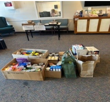
226.76 lbs. & $375 "souperbowl" challenge for NHMARF

Would love to see how you spread Joy. Friend me on Facebook or send a pic to office @milfordumc.org