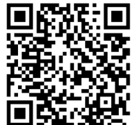
May 4 – May 8

HWELC Happenings: Enjoy some Holy Word Early Learning Center updates in our weekly newsletter by scanning this QR code.