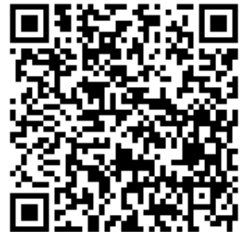
Men's Retreat 2026