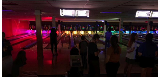
Students went bowling as part of the Overnight.

On March 8-9, the Student Ministry hosted a memorable overnight event at the church. It was a night filled with laughter, friendly competition, and shared experiences. The girls enjoyed dance parties, while the boys, in true spirit, stayed up all night. The morning brought us together again for a delicious pancake breakfast, made possible by the kind assistance of our Deaconesses. This event truly showcased the strong sense of community and camaraderie within our Student Ministry.