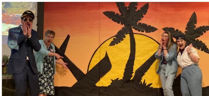
Escape Room: Can You Get Off The Island?

Even if you cannot join us for the game, you can still join us for some games and food right after church. We'll grill burgers and hot dogs and have yard games for friendly competition. So, instead of running off to your favorite lunch spot on July 7, plan to stick around and make some new friends.