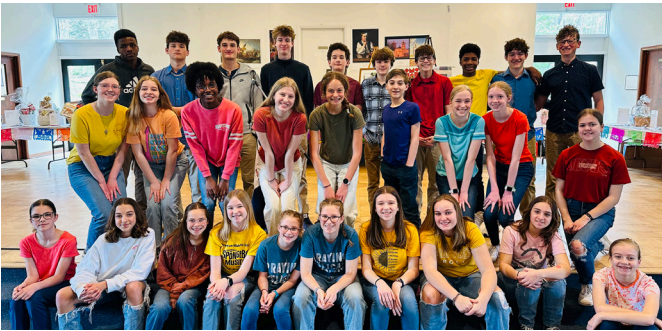
Fiesta For Christ Student Group

I am thankful for the opportunity the Students and I had to serve the congregation through our Youth Sunday, April 7. The students did a fantastic job greeting, hosting, and leading the congregation in praise of our God. I am thankful for the opportunity I received to preach about the Student Ministry. I hope to continue to direct the Student Ministry with the congregation of North Park into our mission to Worship, Connect, and Impact those in our congregation, the surrounding community, and the world.