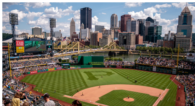
Next July's COMPASS event is at PNC Park.