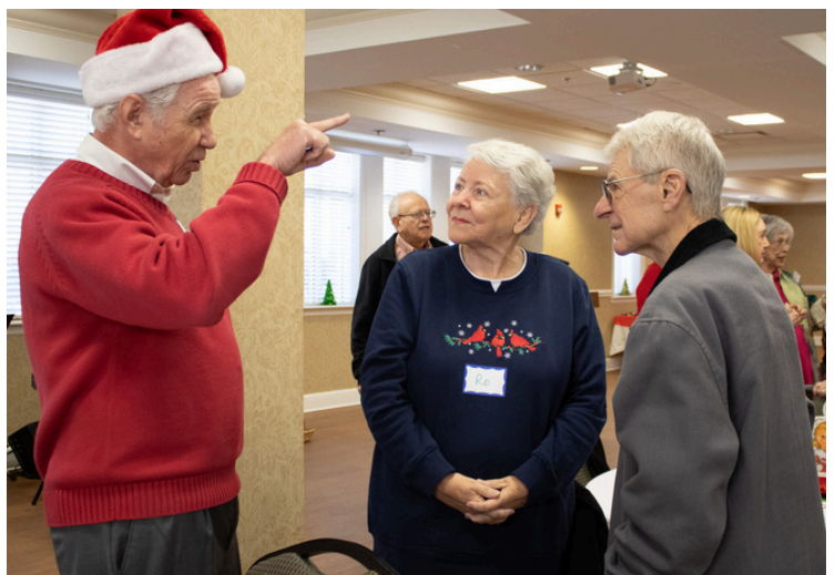
The Connections Older Adult Ministry celebrated Christmas with party games, music, good food, and plenty of laughter.