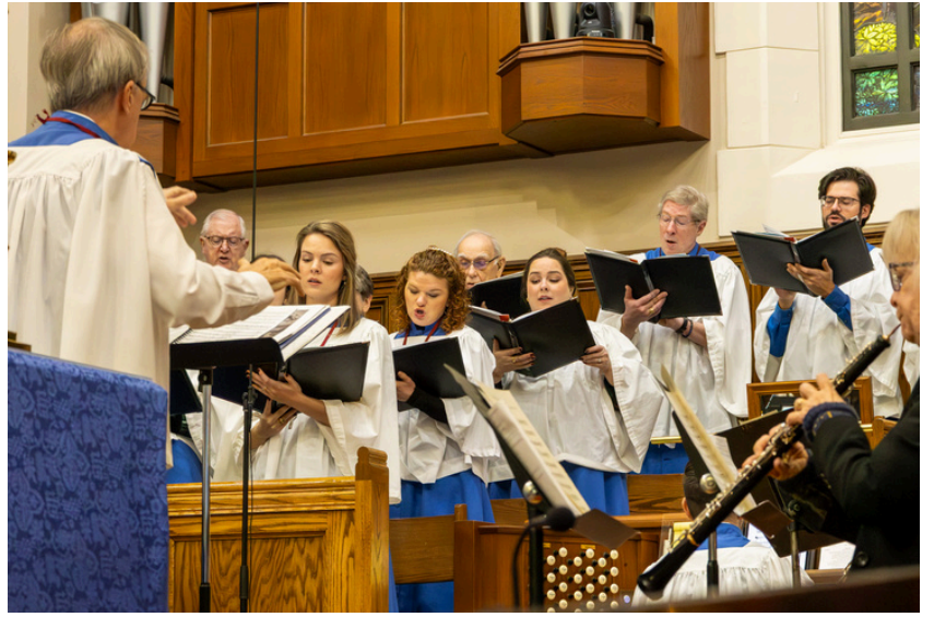
Pictured above: The Wesley Ringer Bell Choir and Chancel Choir at the Annual Christmas Music service. Pictured below: The Children's Ministry shares the joy of the season through Christmas caroling.