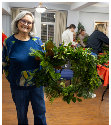
Pictured above: The Well Women’s Ministry, Greening Our Faith brought women together to create wreaths and reflect on the season of Advent. Pictured below: The Augusta Beckman Circle gathered to celebrate Christmas.