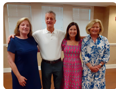
2024 Special Mission Recognition Honorees