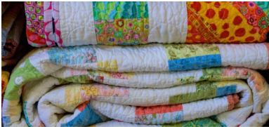
Crafters on a Mission Monday, Jan. 20 9:30am meet at the church

Connect with the Church Center App to see the church calendar and give online! Scan this QR Code.