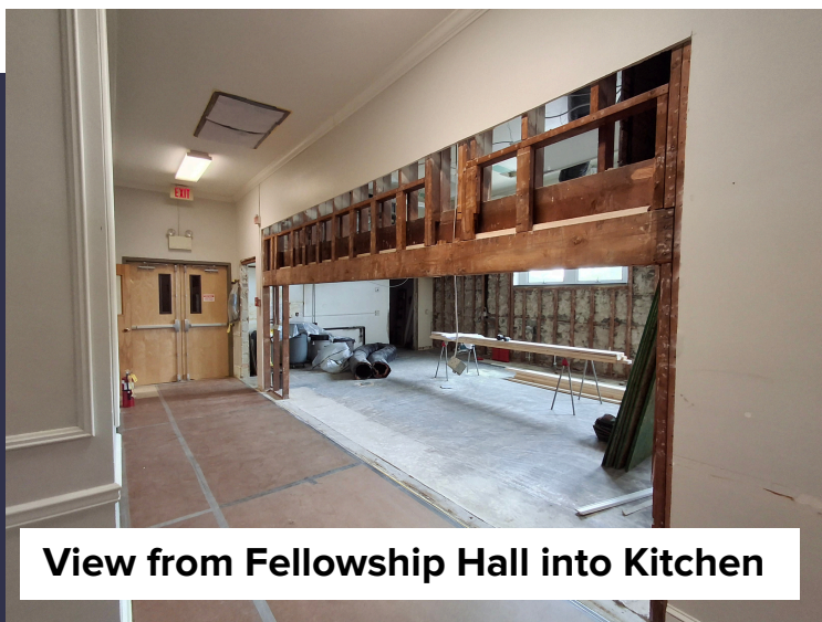
View from Fellowship Hall into Kitchen

Thank you for your patience and continued support as we create a kitchen that will serve our congregation and community more effectively for years to come. Stay tuned for more updates!