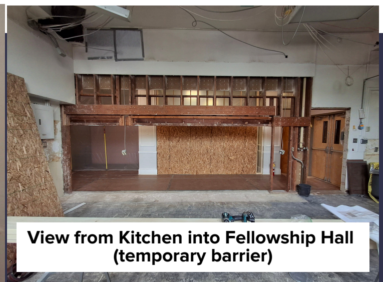
View from Kitchen into Fellowship Hall (temporary barrier)