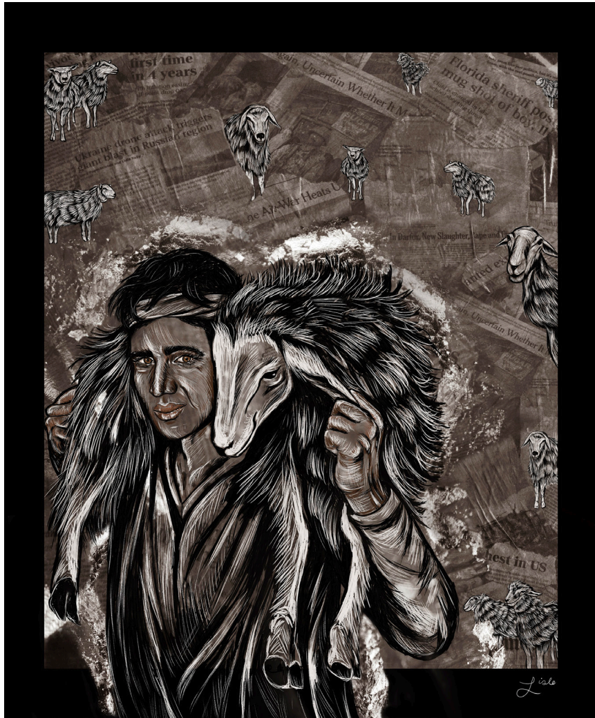
Lost and Found | Lisle Gwynn Garrity Digital painting and collage

What do you see in the art? How does the art make you feel?