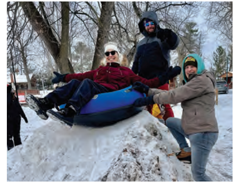
PHOTOS: Mid-winter Intergenerational Retreat

See how our Top-Rated, Faith Based Preschool Program is building bright futures for Minnesota's littlest learners, and schedule a tour at: https://trinitylc.org/learning/children/preschool