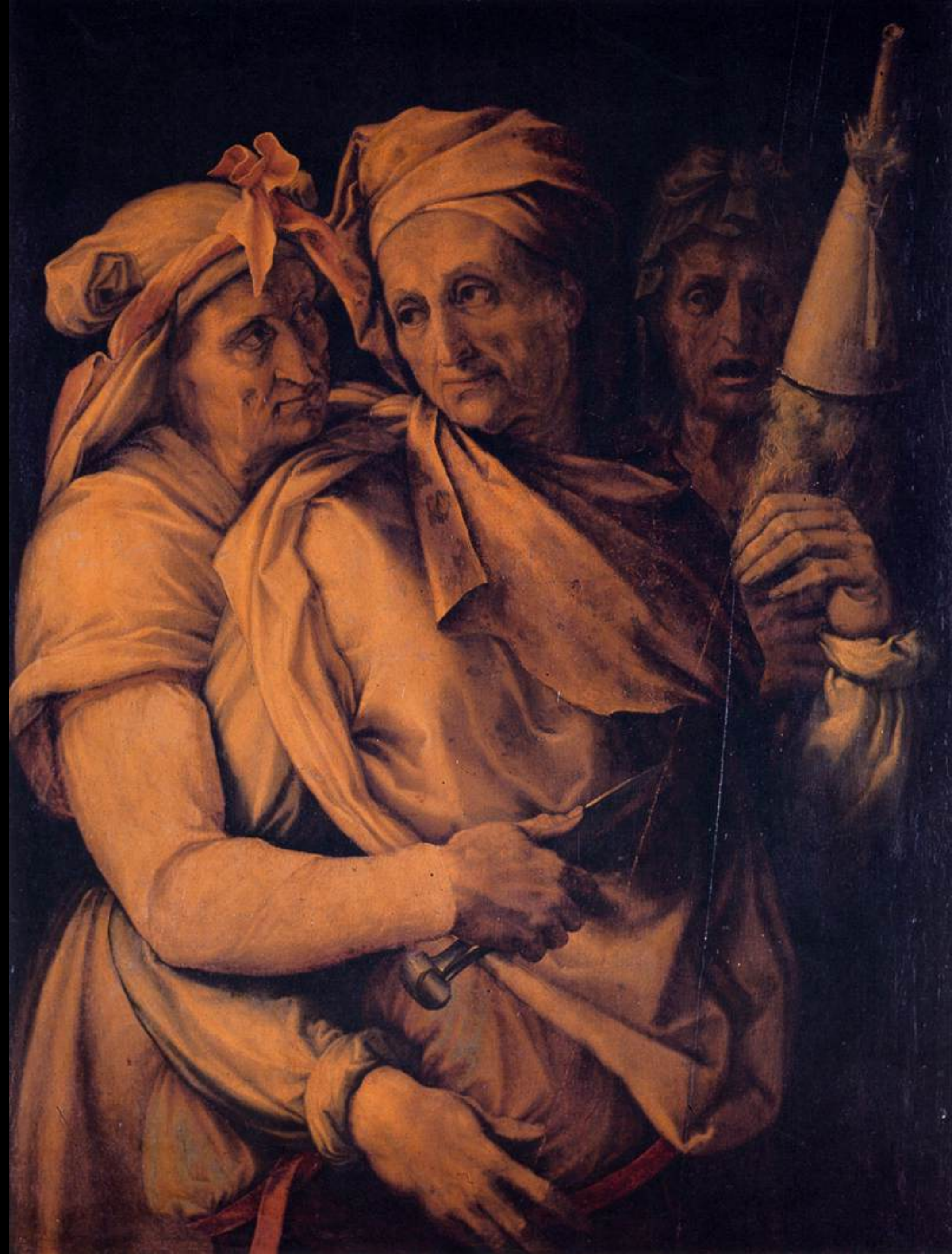
Francesco Salviati (Italian, 1510–1563) The Three Fates (1550) oil on panel