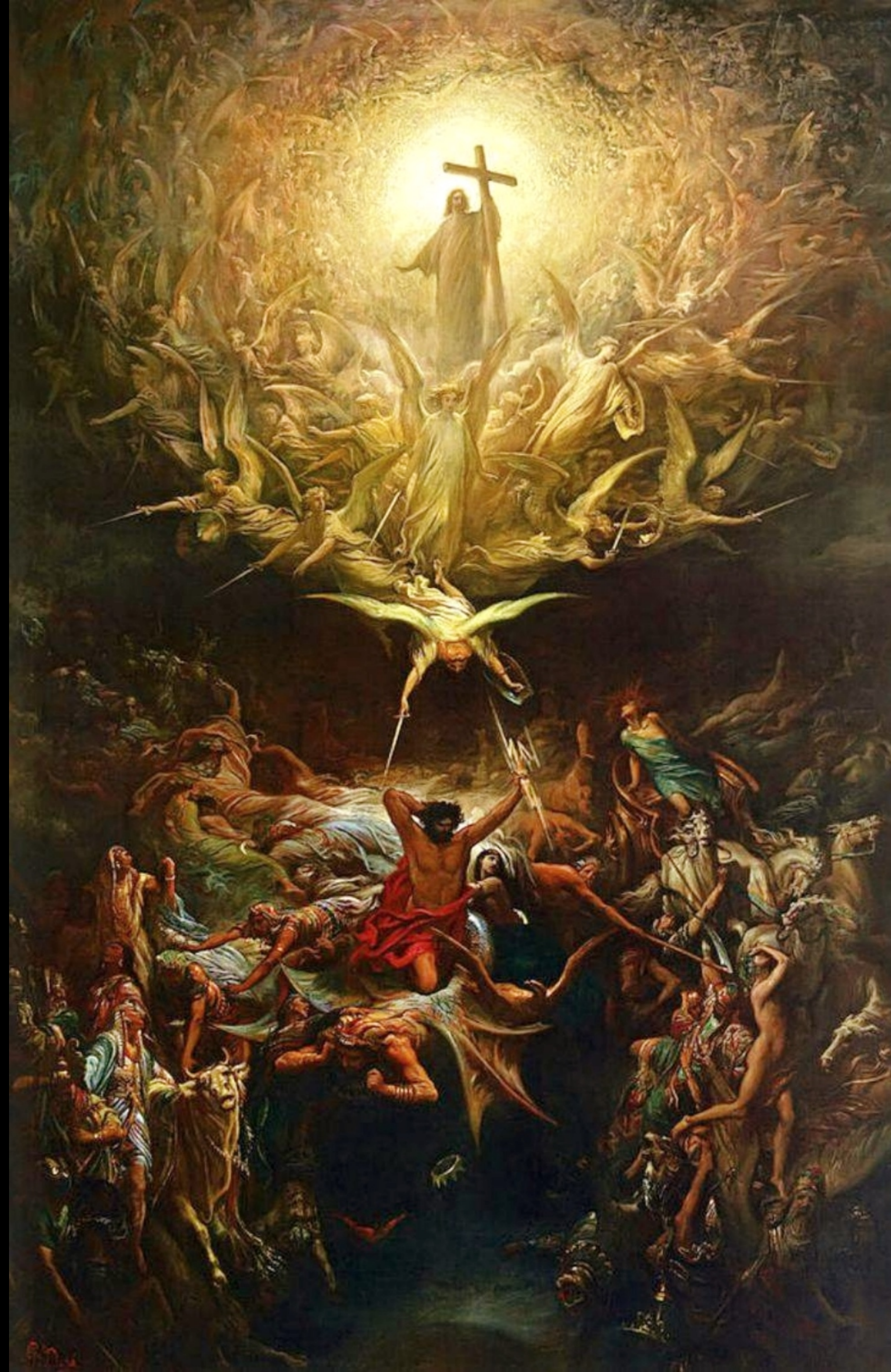
Gustave Doré (French, 1832–1883) The Triumph of Christianity over Paganism (1868). Oil on canvas.