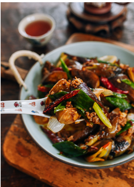
Fish Fragrant Eggplant

The church is to be a working model of God's Kingdom here on earth.