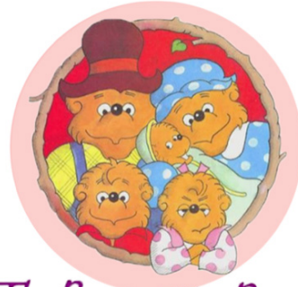
The Berenstein Bears