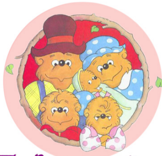
The Berenstain Bears