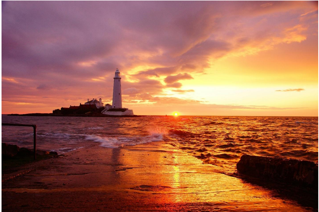
Five-Day Devotional: The Last Thing God Said August 11-15, 2025