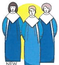
NEW Choir Stoles needed

As we continue to move forward as First Methodist Church of Conover, some of you may have noticed at the late service that our choir is not wearing the stoles as they once did. This is because some of them are embroidered with our former denomination's logo. So the choir is going to have to replace the stoles. They have put together the new stoles with Thomas Creative Apparel (Thomas Robes) and are in the process of ordering. Anyone that would like to support the Chancel Choir with the purchase of the new stoles, please make checks payable to FMCC and put "Music Fund - choir stoles" on the memo line.