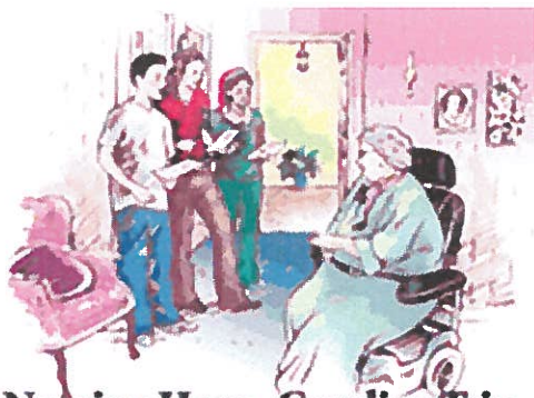
Nursing Home Caroling Trip

Please mark your calendars and join us for this special Christmas tradition.