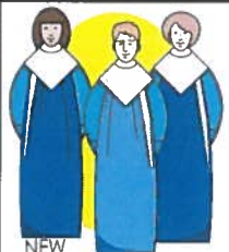
Choir Stoles needed