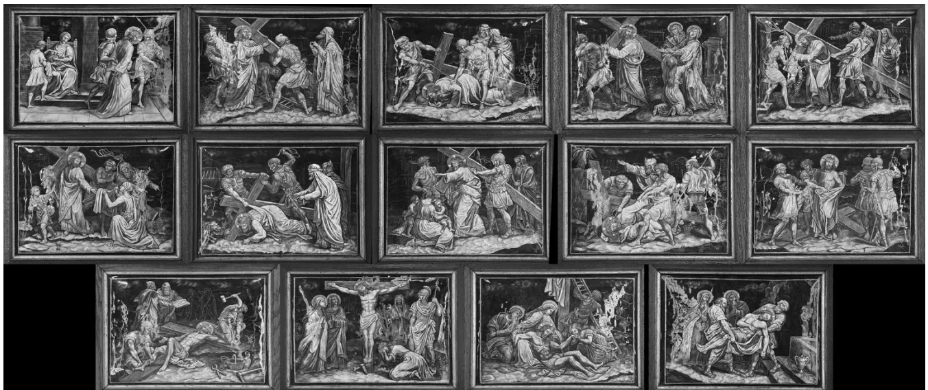
Collected enamel set, Notre-Dame-des-Champs, Aoranches

Traditionally, the stations are made before a series of plain wooden crosses placed along the walls of the church. With each cross there is sometimes associated a pictorial representation of the event being commemorated.