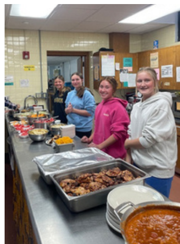
FOOD AT FIRST YOUTH GROUP NIGHT