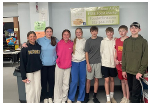
FOOD AT FIRST STUDENTS