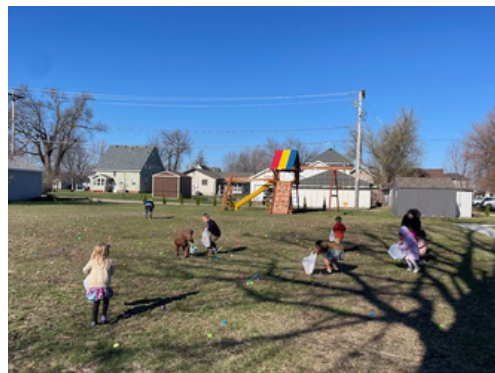
THIS YEAR'S EASTER EGG HUNT!