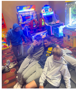
FLC Youth Group Perfect Games Outing