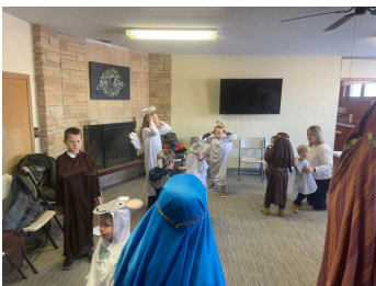
Sunday School Christmas Program