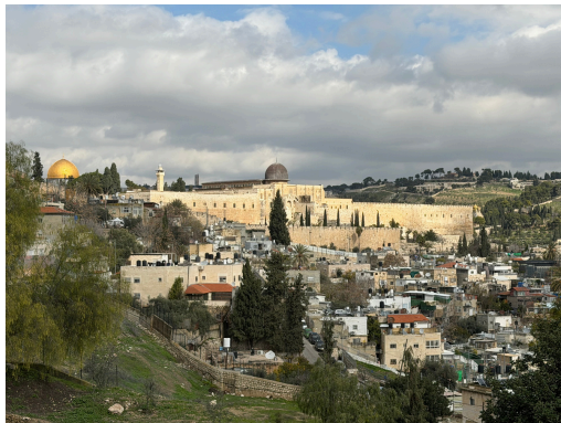
Looking Towards Jerusalem