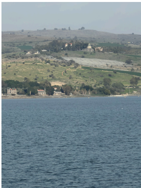
Sea of Galilee Looking Toward The Sermon On the Mount Location