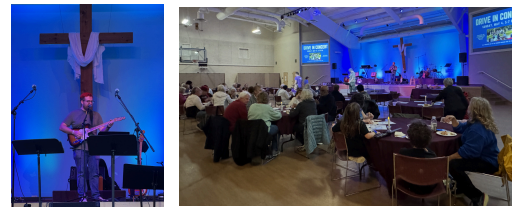
Pictures from last year's concert, which was indoors due to the weather, but still so much fun!

Our annual drive in concert will be Sunday, May 5 from 5-7 p.m. out by the Northwest Children's Garden. This year's concert will be a variety show featuring members of our own Gathering Band and a cookout dinner is included with admission. Ticket sales begin April 12. Visit nwumc.com/drivein for more details.