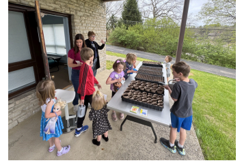
Planting seeds for the grow lights this April

Nursery care and Children's Small Groups continue to meet every Sunday during both the 9:30 and 11:00 services. Each Sunday includes a lesson and fellowship time. The kids have also started work in the garden for the growing season and will spend time outside as weather permits.