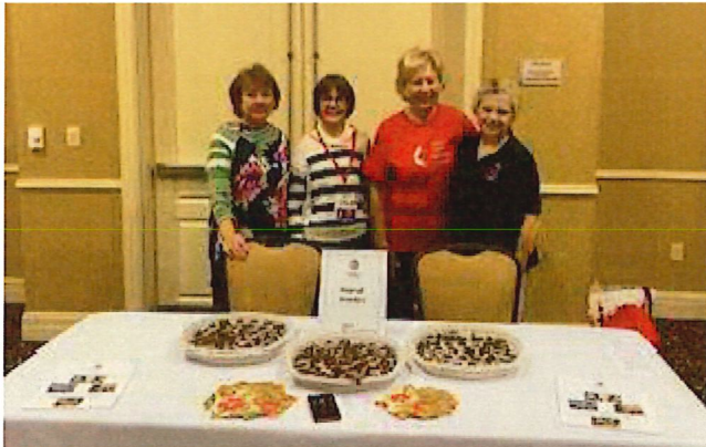
UWF volunteers at "Just Desserts", sponsored by Southwestern Illinois Violence Prevention Center

JOSEPH AND THE AMAZING TECHNICOLOR DREAMCOAT at UNION Saturday evening, JUNE 27 Sunday morning, JUNE 28, 9 am service AUDITIONS: MAY 9 and 10 at 1 pm