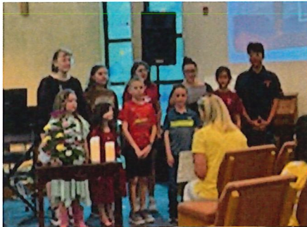
Children/Youth choirs sing at March 22 services