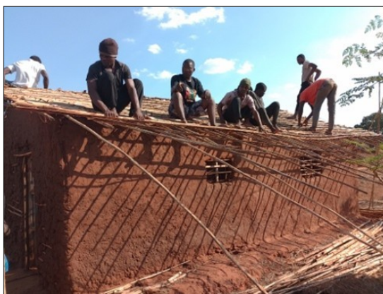
L to R: Students working together and students roofing a church