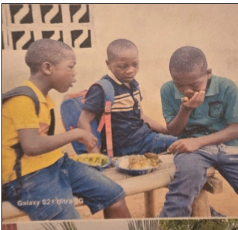
Lunch time at Caleb Children's School and our worship hall and host for Bible for Souls College.