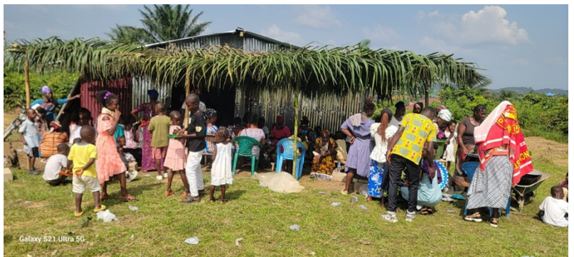
Back to the Bible campaign held at the Success Church in February 2026