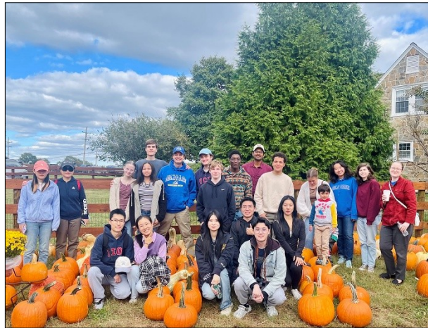
Fall outing to Milburn's Orchard