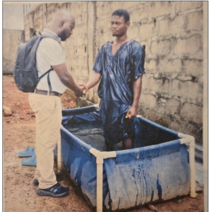
One of many baptisms that took place in 2025