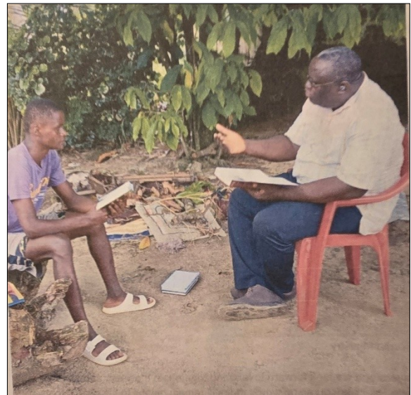
House to house teaching