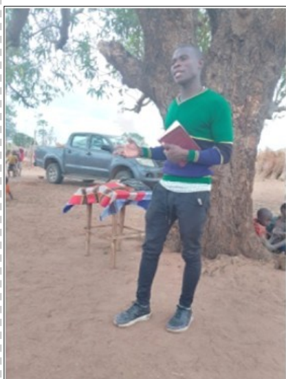
Preaching under a mango tree

The Psalms translation project is starting early 2026. Our Bible School students as they return to work in their churches. Peace in Mozambique Our teammates the Bunches as they begin language study Good rains to produce bountiful crops