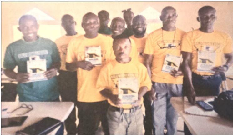
Bible for Souls College students