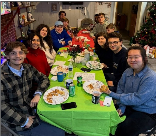
Tuesday night meal and Bible Study