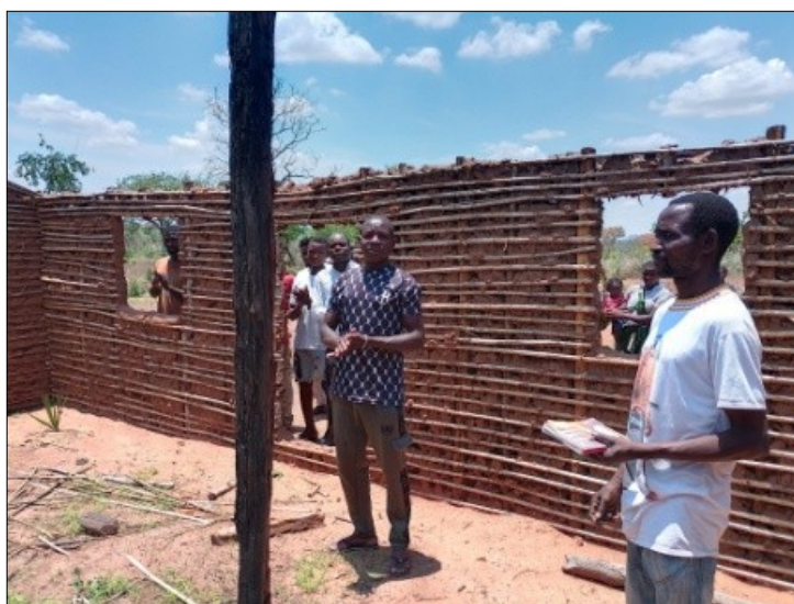
Rebuilding the Minhunha church building

Support for the Westerholm's mission work in Mozambique is provided through a special contribution collection during the month of November each year. Normally, around $1,200 is raised each year to send to their sponsoring congregation in Cordova, TN.