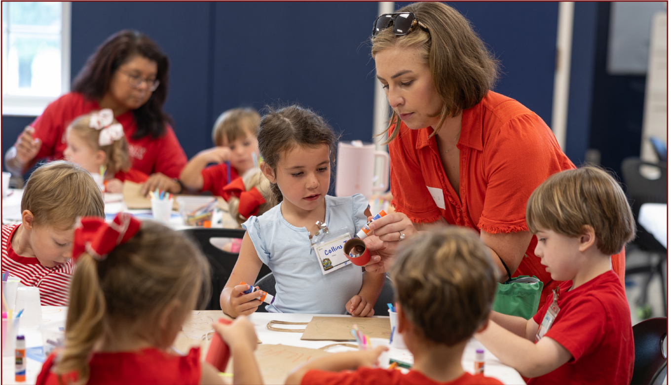
Vacation Bible School participants work on their first project of the week.

Rainforest Falls VBS was unforgettable as more than 400 children gathered to discover God's nature and learn that His love never fails. Through worship, Bible adventures, games, snacks, crafts, and hands-on activities, children explored God's Word while being encouraged to look for "Wow God!" moments all around them.