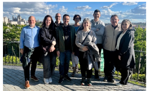
Our leadership cohort in Madrid, Spain