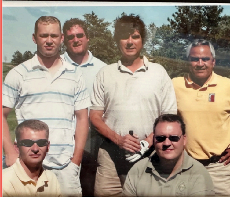
6TH ANNUAL SAVE OUR YOUTH GOLF TOURNAMENT 2004