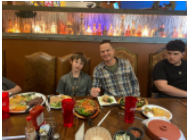
Mentor and Mentee Activities