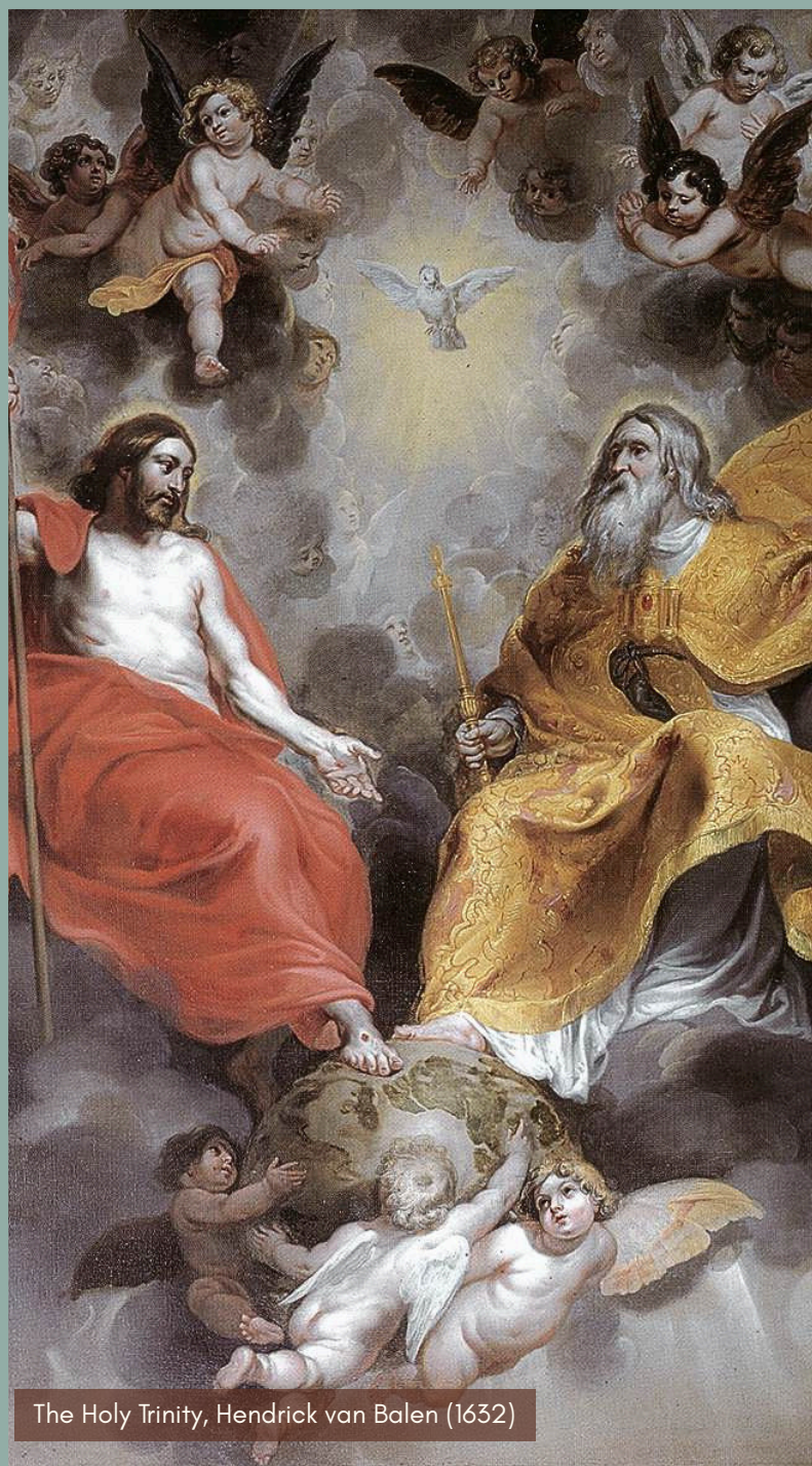
The Holy Trinity, Hendrick van Balen (1632)

5633 HIGHWAY #7, MARKHAM, ONTARIO L3P 1B6 | PHONE: 905-294-5955 | WEBSITE: HTTPS://STPATRICK.ON.CA/