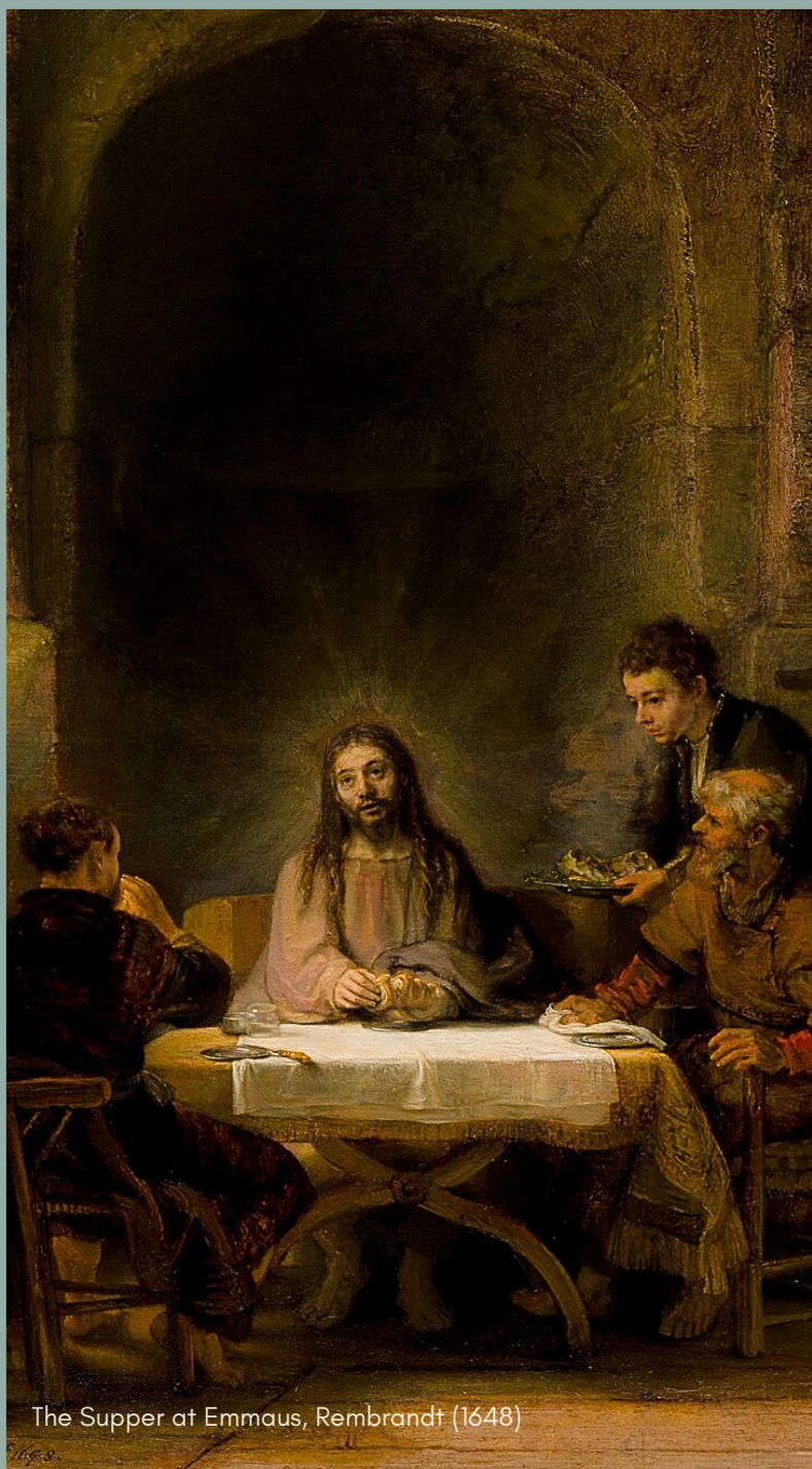
The Supper at Emmaus, Rembrandt (1648)

5633 HIGHWAY #7, MARKHAM, ONTARIO L3P 1B6 | PHONE: 905-294-5955 | WEBSITE: HTTPS://STPATRICK.ON.CA/